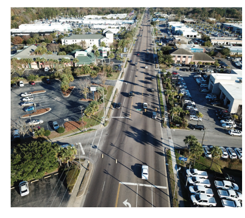
White Oak Drive